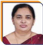
Theyamma Joseph Mar Sleeva College of Nursing, India